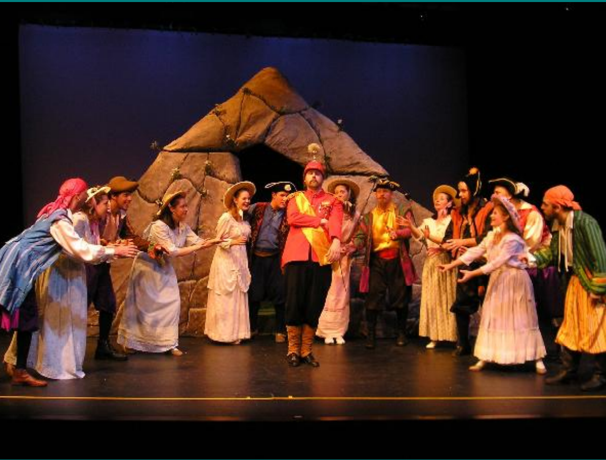
Pirates of Penzance ~ Summer 2005 The Fringe Players